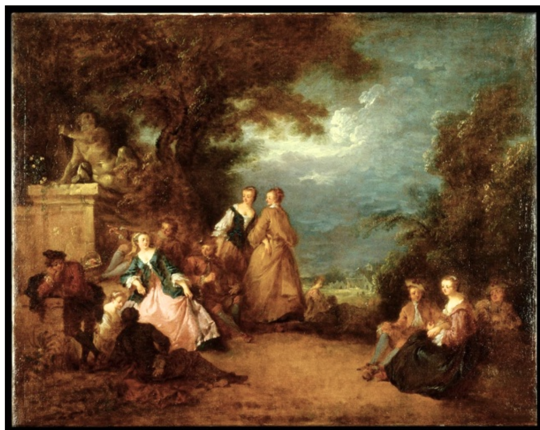
9. Bonaventure de Bar, A Country Fête , 36.2 x 46.3 cm. Baltimore, Walters Art Museum.