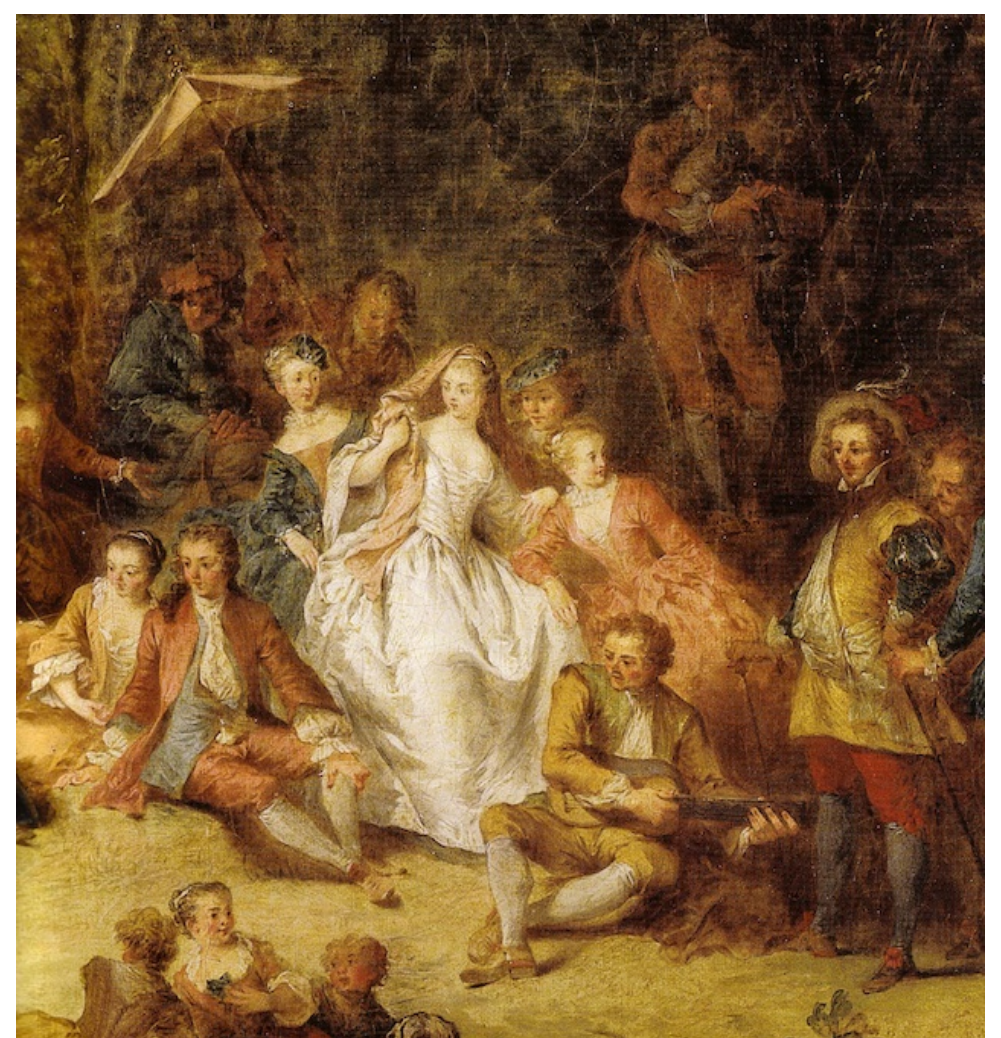
1. Bonaventure de Bar, A Village Fair , c. 1728, 97 x 130 cm. Paris, Musée du Louvre.