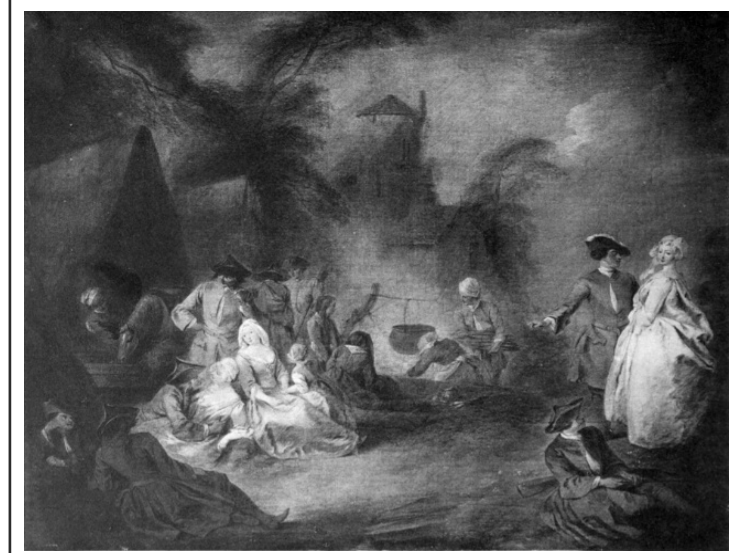
20. Jean Baptiste Pater, A Military Encampment , 62.9 x 76.2 cm. Whereabouts unknown.