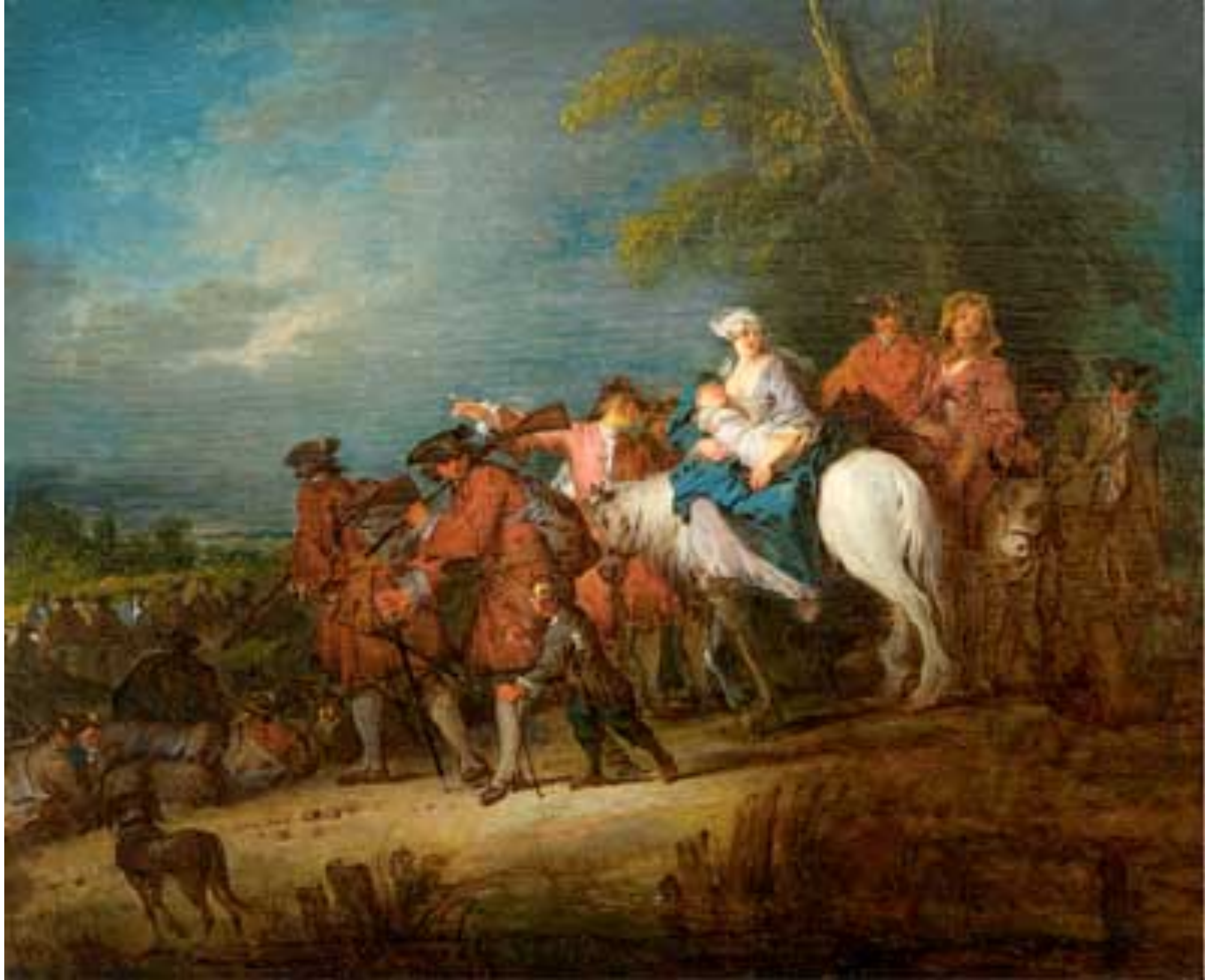
22. Bonaventure de Bar, A Military Convoy , 22.6 x 27.6 cm, oil on oak panel. Paris art market.

Finally, we should consider a painting that appeared on the Paris art market in 2016. It shows a convoy of soldiers coming over a hill onto a plain and a military encampment. Accompanying them are two women, camp followers or wives, one suckling an infant. Also a small child tries to engage one of the soldiers. Albeit diminutive, it possesses a definite charm. When it first appeared, it was attributed to Pater. Yet it has none of that master's characteristics. It is more solidly painted, the figure's proportions—especially the lengthened torsos, compare quite closely with de Bar's characters in the Amiens painting. Independently and concurrently, Alastair Laing concluded that the painting was by de Bar. The faces in this picture may recall those of Pater, but there is none of the silly frivolity of expression that one finds in his art. Whereas all the de Bar paintings discussed thus far are on canvas, this example is on panel. In that artists often shifted from one support to another, it is quite probable that one day we will find de Bar paintings on copper as well.