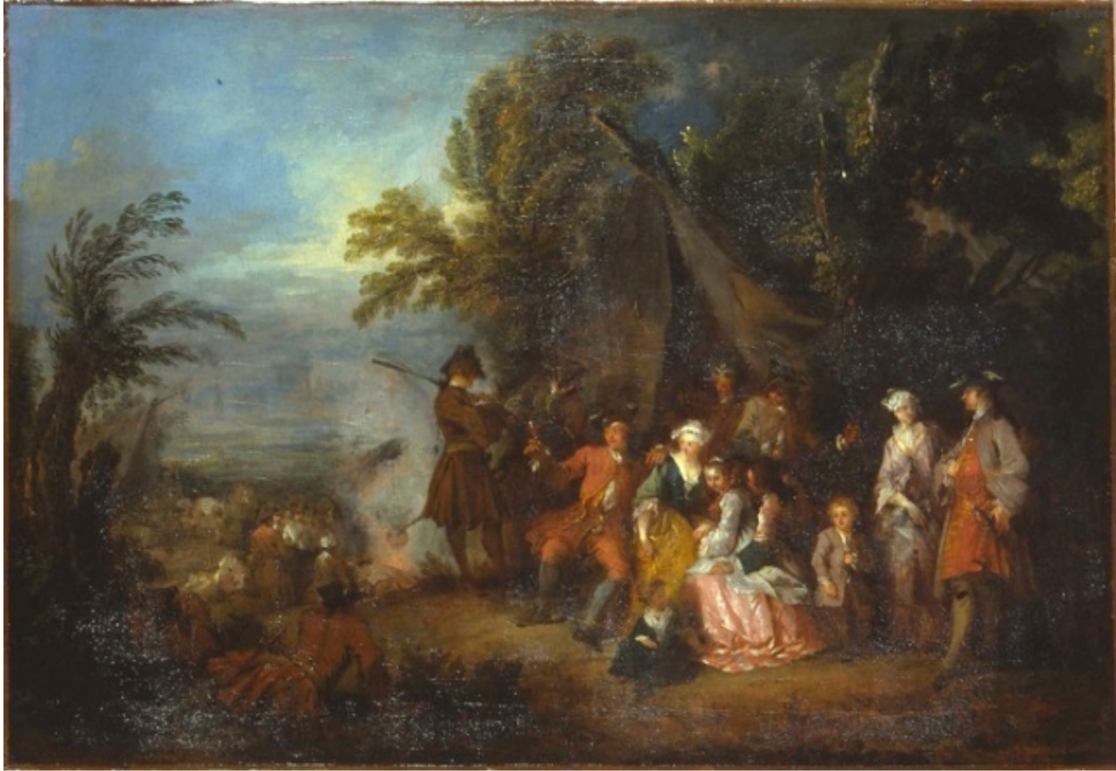
21. Bonaventure de Bar, A Military Encampment , 41.9 x 63.5 cm. Amiens, Musée de Picardie.

Also to be considered is a painting in the Musée de Picardie, Amiens, which shows a similar scene of soldiers, women, and children in a military camp (fig. 21). Although it is the same size as de Bar's Village Fête in that museum, is not its pendant. The attribution of the Amiens painting has veered in a number of directions over the course of the twentieth century. 75 In 1890, when the Lavalard brothers donated it to the museum, it was classified as an anonymous work of the eighteenth century. Then opinion swayed in all directions: it was given to Lancret, an attribution that does not bear scrutiny; once it was improbably assigned to the young Watteau; it was rejected as not even being an eighteenth-century painting; but most often it has been given to Pater or his circle. Yet it clearly is not by Pater or his students, and the museum's present classification as "suite de Pater" is misleading. The faces of the women, for example, have little to do with Pater, but they are closely related to those in de Bar's fêtes galantes. These differences of opinion remind us of the still undefined terrain surrounding Watteau's so-called satellites.