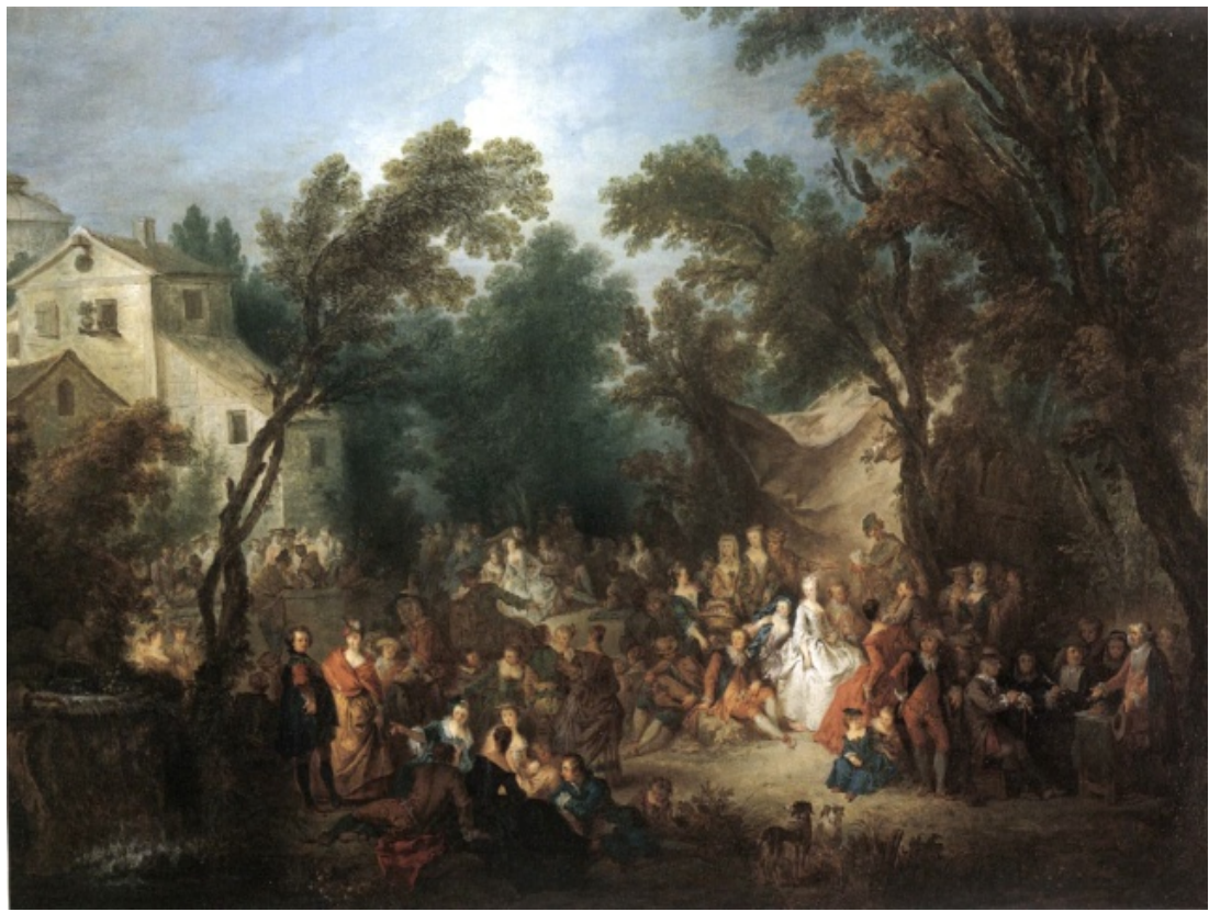
12. Bonaventure de Bar, The Village Wedding , 64.8 x 90.2 cm. Whereabouts unknown.

Also lacking both a description and measurements, and therefore almost impossible to ever identify is a work sold in 1779 by the dealer Aucun. It was described just as "A French fête, de Bar, disciple of Watteau." 56