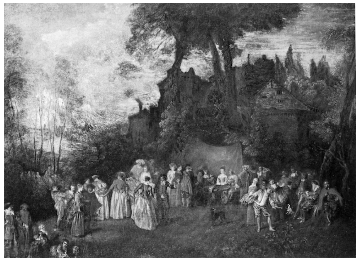
15. Antoine Watteau, L'Accordée de village , 63 x 92 cm. London, Sir John Soane's Museum.