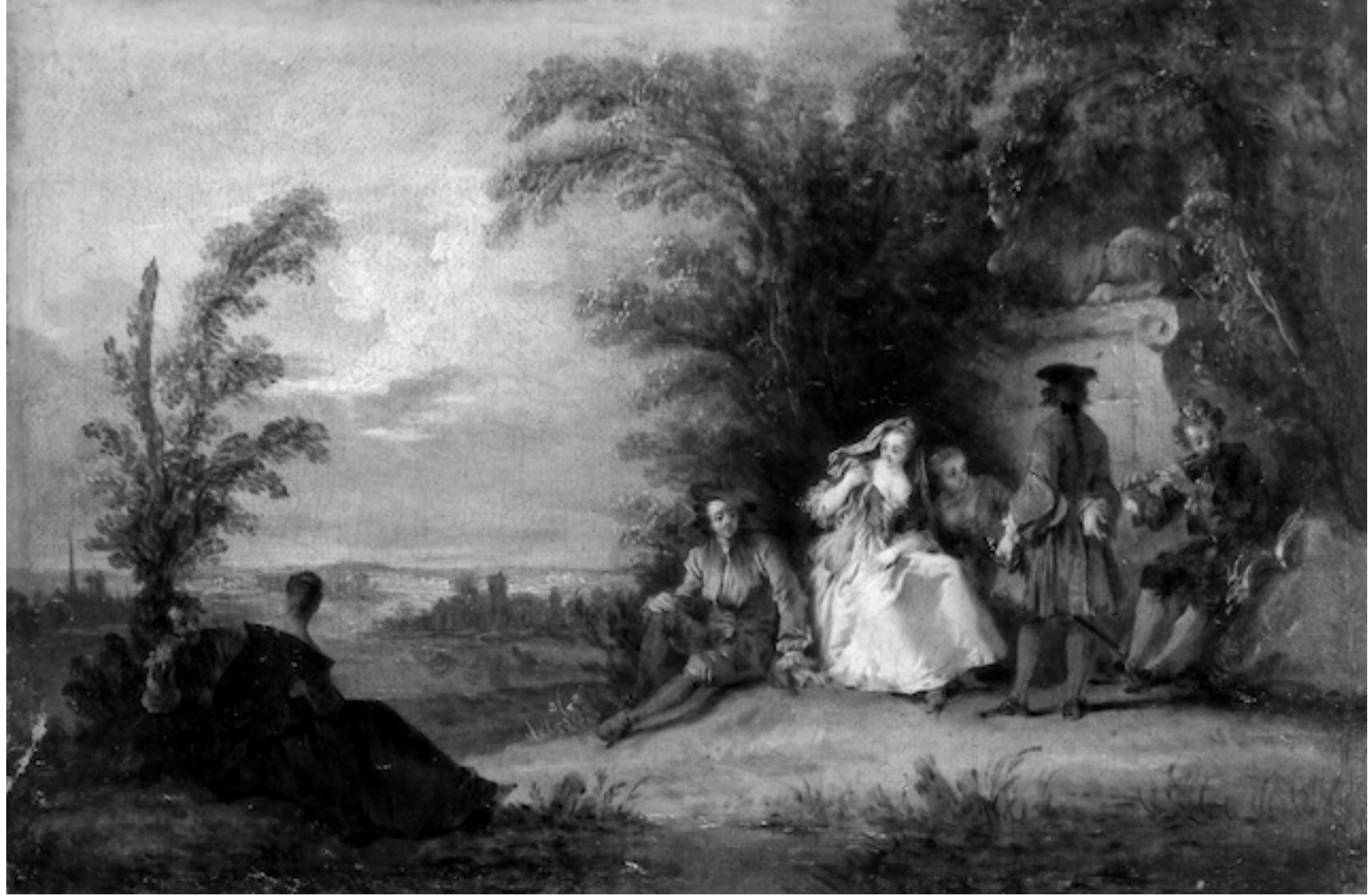
16. Bonaventure de Bar, A Country Fête , 19.7 x 29.3 cm. Houston, Museum of Fine Arts, Sarah Campbell Blaffer Foundation.

Of all the many other extant fêtes galantes which have been assigned to de Bar, only a very few are actually by him. One painting which has an excellent claim is a charming, very small fête galante owned by the Blaffer Foundation (fig. 16). It surfaced in 1955 in the collection of Mrs. Randal Plunkett of Dunsany Castle in Ireland. 68 Expectably, it was then attributed to Pater and remained under that name until Alastair Laing recognized that it was by de Bar. Indeed, there is no mistaking de Bar's hand here. It has been said that the figures in the Blaffer painting are identical to those at the center of the Louvre Village Fair (fig. 2), and that this small painting "must be either a study related to the development of the larger composition or a replica of its central motif." 69 This perhaps overstates the case, since the only two figures that the two works share are the woman with the cape over her head and her female companion. But this correspondence alone helps assure the attribution of the Blaffer painting to de Bar.