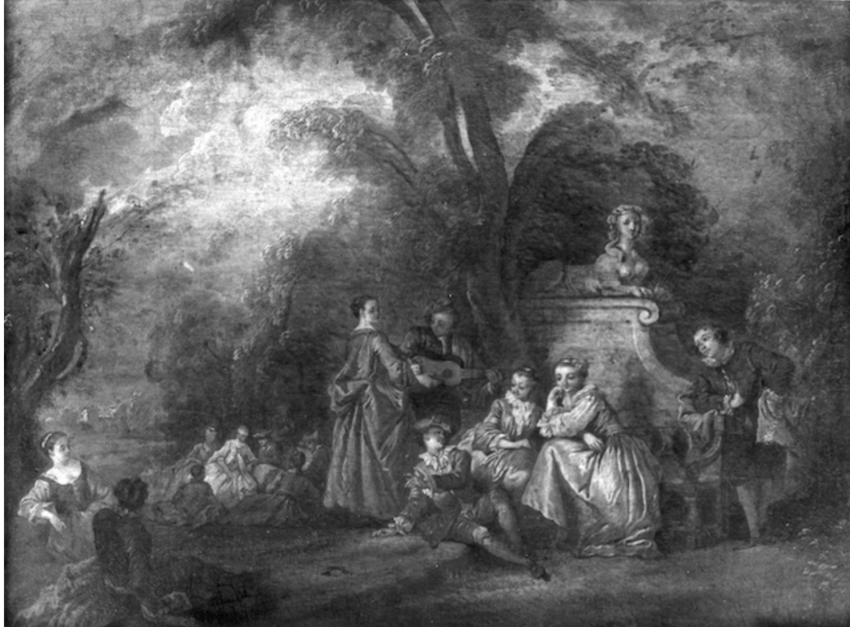
11. Bonaventure de Bar, A Country Fête , 37.5 x 46.3 cm. Rouen, Musée des Beaux-Arts.

As we have seen, there originally was a pendant to the picture sold in 1818, but one might wonder if both versions had pendants. One of the lost pendants, quite possibly, is a canvas in the Musée des Beaux-Arts of Rouen, which I know only from a poor photograph (fig. 11). This work once belonged to the eighteenth-century painter Jean Baptiste Descamps (1714-1791) and then was donated to the museum. 42 For many years it was classified just as “French school, eighteenth century,” but more recently it was reattributed to a follower of Bonaventure de Bar. Its size corresponds to the painting in Baltimore and its twin, and the disposition and scale of the figures harmonize with those two paintings.