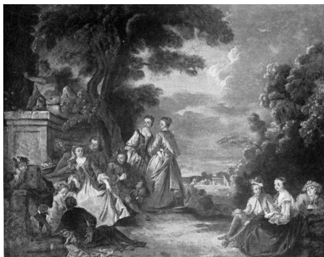
10. Bonaventure de Bar, A Country Fête , 36 x 47 cm. Whereabouts unknown.

Similar success can be had with a pair of de Bar pendants that were sold in Paris in 1818. Then they were described in only the most general of terms: "Pastoral scenes in landscapes and imitative of Watteau. These two paintings form pendants. W. 17 pouces [46 cm] x H. 14 pouces [38 cm]. On canvas." 38 While the description is obviously too generic to be of use, the dimensions correspond to a composition by this artist that exists in two seemingly identical versions. One is in the Walters Art Museum, Baltimore (fig. 9), and the second has been on the art market (fig. 10). Henry Walters bought his picture from the Glaenzer Gallery of New York in 1904, at which time and still until recently it was considered to be by Pater. 39 In 1990 Alastair Laing proposed an attribution to de Bar, pointing out the stylistic similarities with a picture in the Blaffer Foundation (fig. 16). 40 The second version, of identical composition and size, appeared on the Paris market in the 1920s and was on the New York market in recent years. 41 Remarkably, this second work was already classified in 1929 as "attributed to Bonaventure de Bar," and then was fully ascribed to him a few years ago. Until now no one realized there were these Doppelgänger. As best as can be judged from photographs, they appear to be of identical quality.