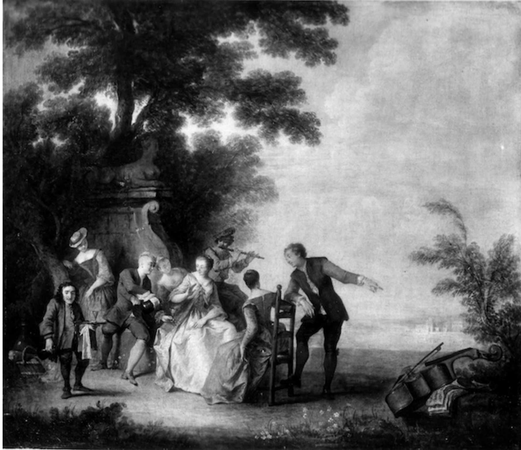
6. Bonaventure de Bar, A Day in the Countryside , 57 x 68 cm. Whereabouts unknown.

A similar turn of events can be observed apropos of another de Bar painting, one that appeared in a Parisian sale in 1781: