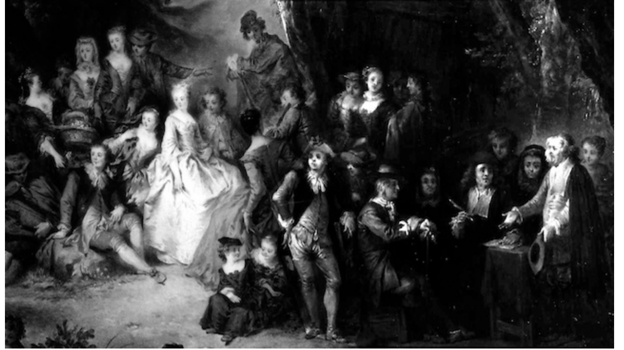
13. Detail of fig. 12

Finally, there are several extant de Bar paintings that deserve consideration. The first is a very important picture that can be documented to the eighteenth century, although the documentation itself is highly problematic. The painting in question depicts a village wedding, with the signing of the wedding contract tucked into the right corner (figs. 12-13). The rest of the canvas is devoted to the great throngs attending the ceremony. The dimensions of this picture are slightly smaller than those of de Bar's morceau de réception , but its repertoire of more than eighty characters and the elaborate landscape are noteworthy. We cannot be sure who the original owner was, but by the 1770s the painting was in Belgium, in the collection of Duke Charles Léopold d'Arenberg. At that time it was engraved by Antoine Cardon the Elder (1732-1822) with the unfortunate caption "Antoine Watteau pinxit." The picture remained in the Arenberg family's collection until after World War II. 57