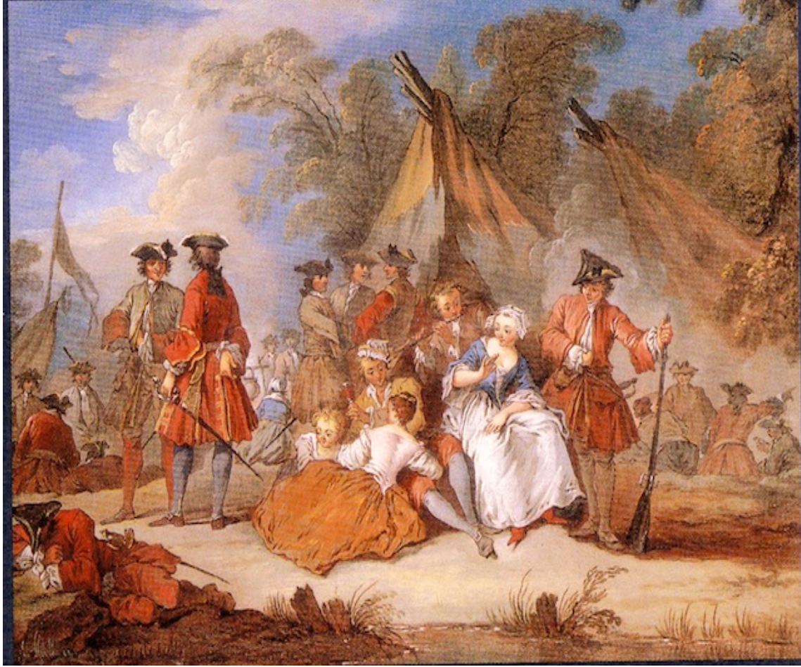
18. Bonaventure de Bar, A Military Encampment , 24 x 32 cm. Whereabouts unknown.